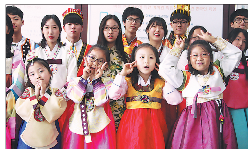
Students at the Korea School in Yantai share a light moment during the 'Discover Yantai' ROK media tour in late June.

However, Huang said that between January and June this year, business was on the rise again, with a 10 percent increase in trade with the ROK. The port handles 13 ships sailing to and from the ROK per week, exporting industrial products, garments and food. Equally impressive is the Yantai-Dalian railway ferry. From the port in Yantai, a large ferry boat with a hollid-out interior is capable