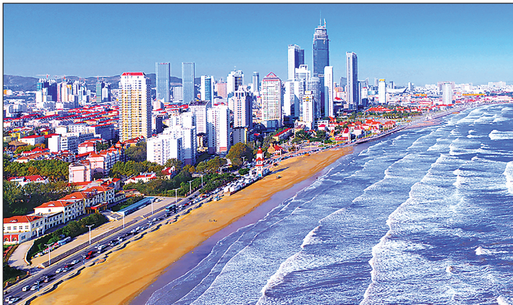
The coastal city of Yantai, in East China's Shandong province, has been trading with the Republic of Korea for more than 2,600 years.