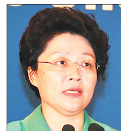
Yantai Mayor Zhang Yongxia

are currently establishing a presence in the park. Asiana Airlines Inc opened a cargo distribution center in the park in March; the first phase of Huanan Korea Town, which involves investment of 28.8 billion yuan ($4.72 billion) is under construction.